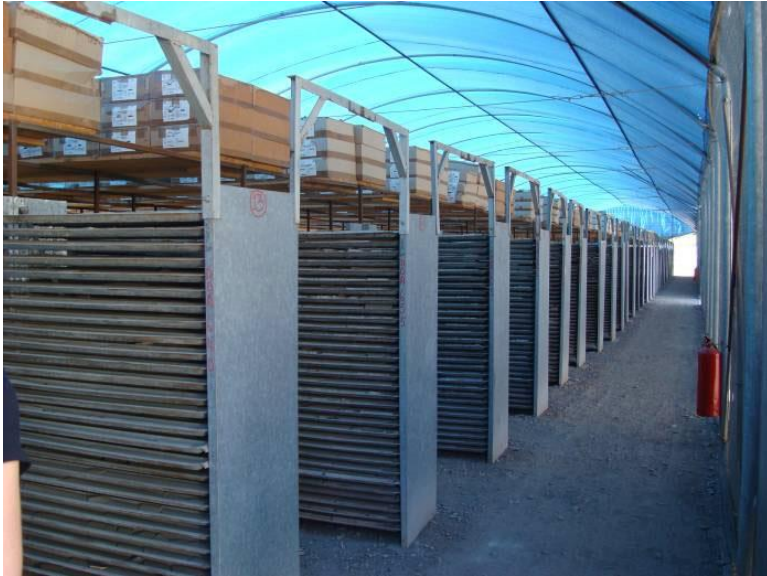
Copiapó core storage facility