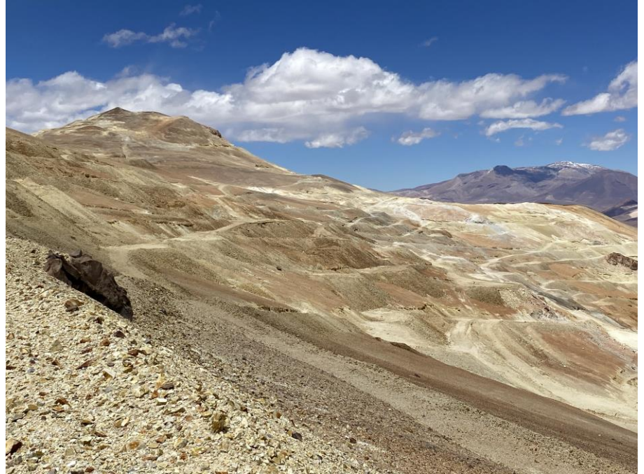
Exploration roads crossing the Dorado West deposit area